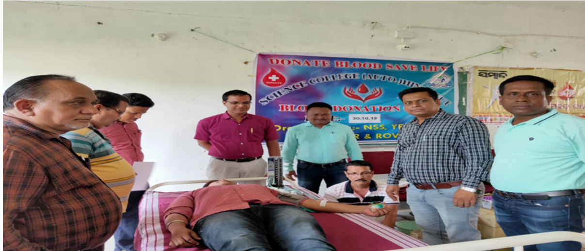
Blood Donation Camp on 30-10-2019