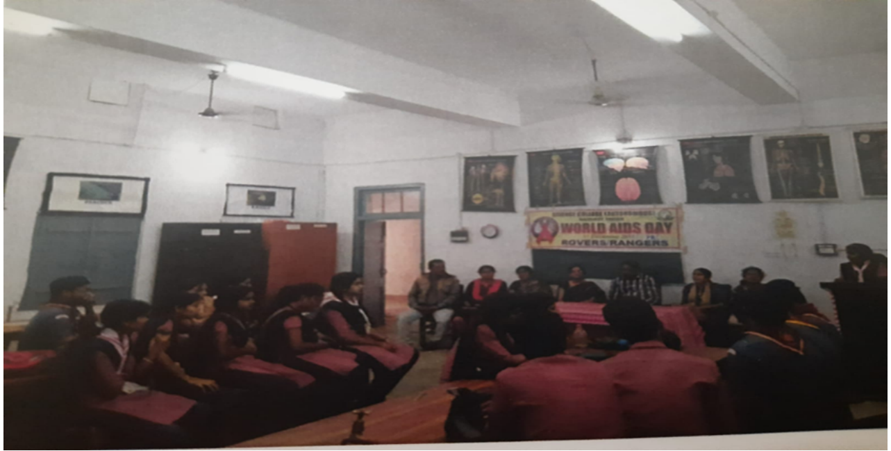
World AIDS day meeting on 2-12-2018