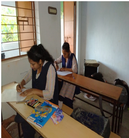
Literary Activity during the camp (Essay Competition), Painting Competition, Debate Competition