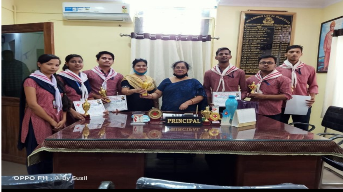
Our Proud Winners of Different Competitions