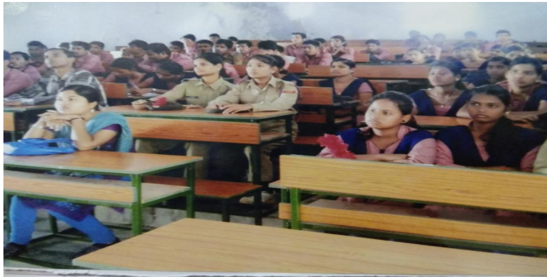
Meeting on World AIDS Day Dated on – 01.12.2015