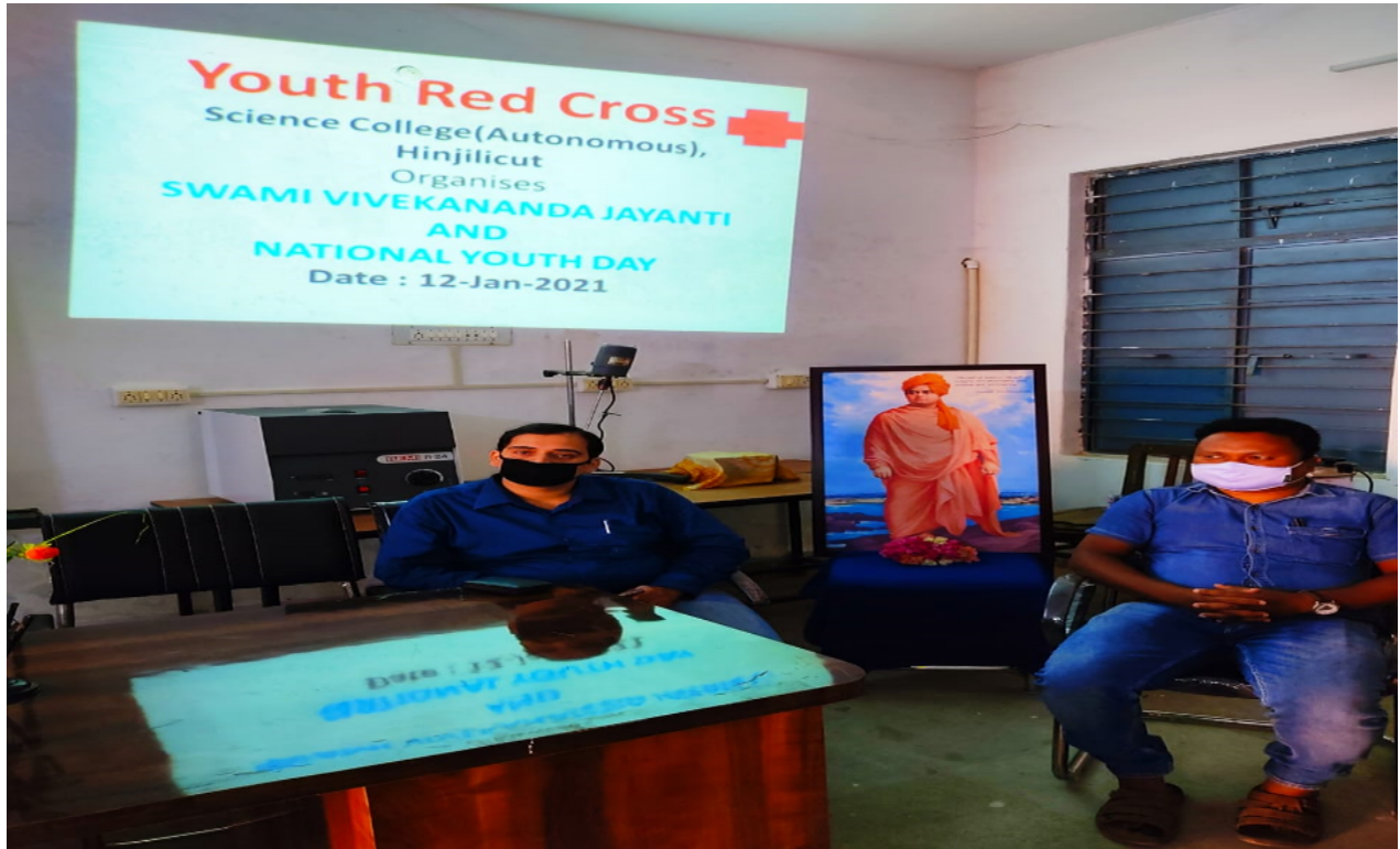
Swami Vivekananda Jayanti was celebrated as National Youth Day on 12-1-2021