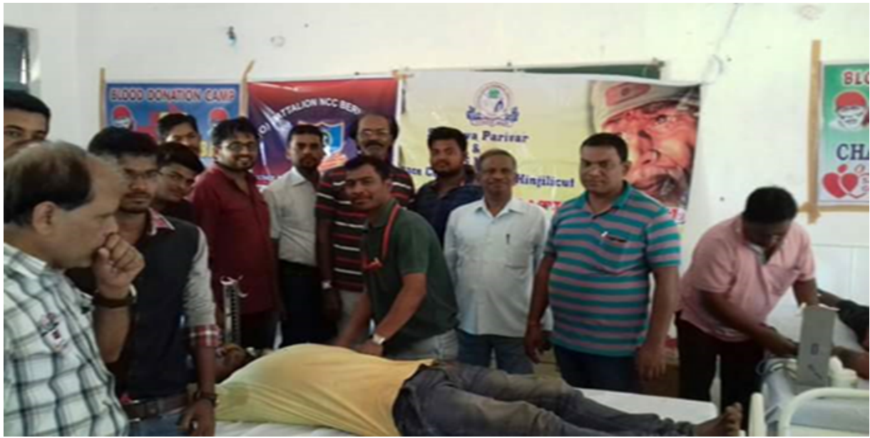
Blood Donation Camp organized by YRC Wing on 2-2-2018