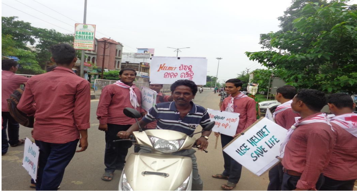
“Helmet Awareness” programme on dated- 26.07.2016