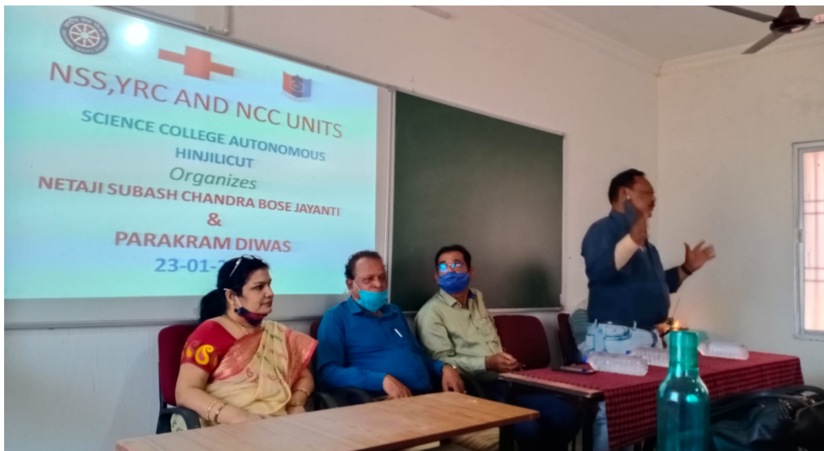
Netaji Subhas Chandra bosh Jayanti was celebrated as Parakram Divas on 23 rd Jan.2021