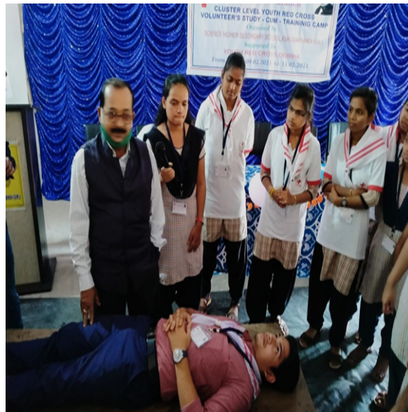
First aid training was given by experts to our Volunteers