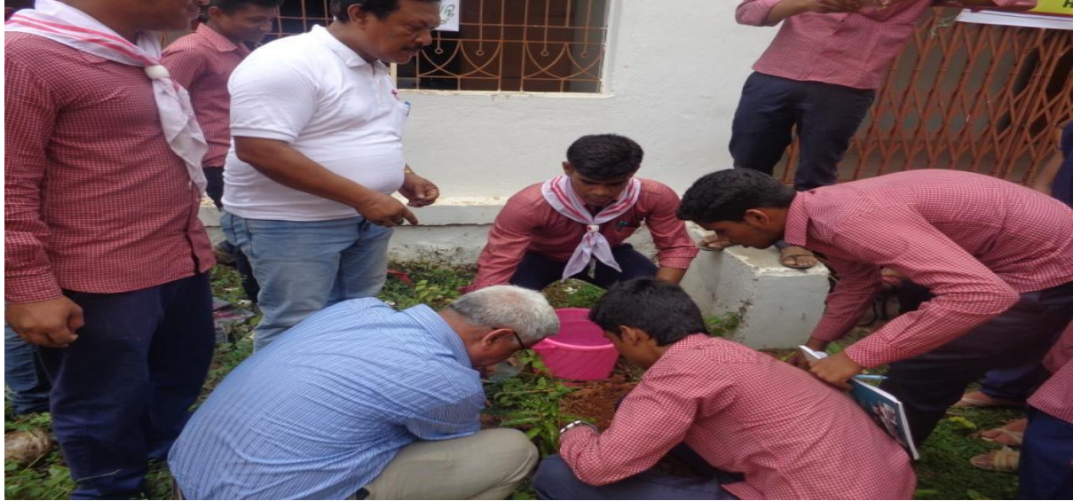
Mega Plantation Day on dated- 02.07.2016