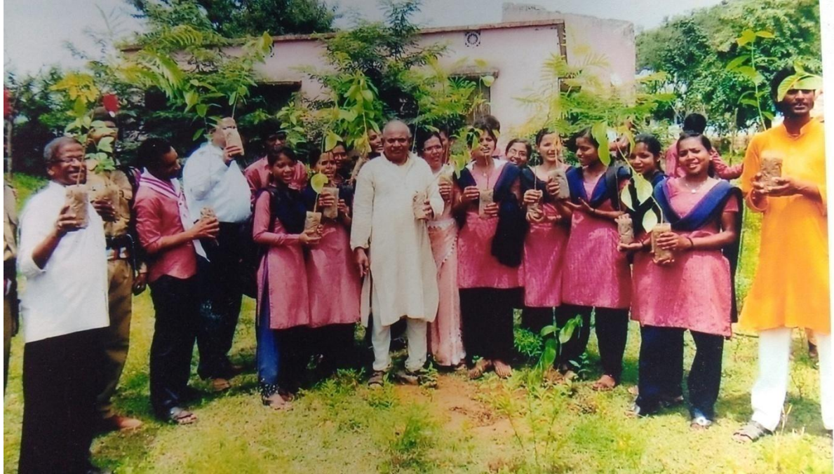
250 PLANTS WERE PLANTED BY YRC VOLUNTERS, DATED ON – 26.01.2015