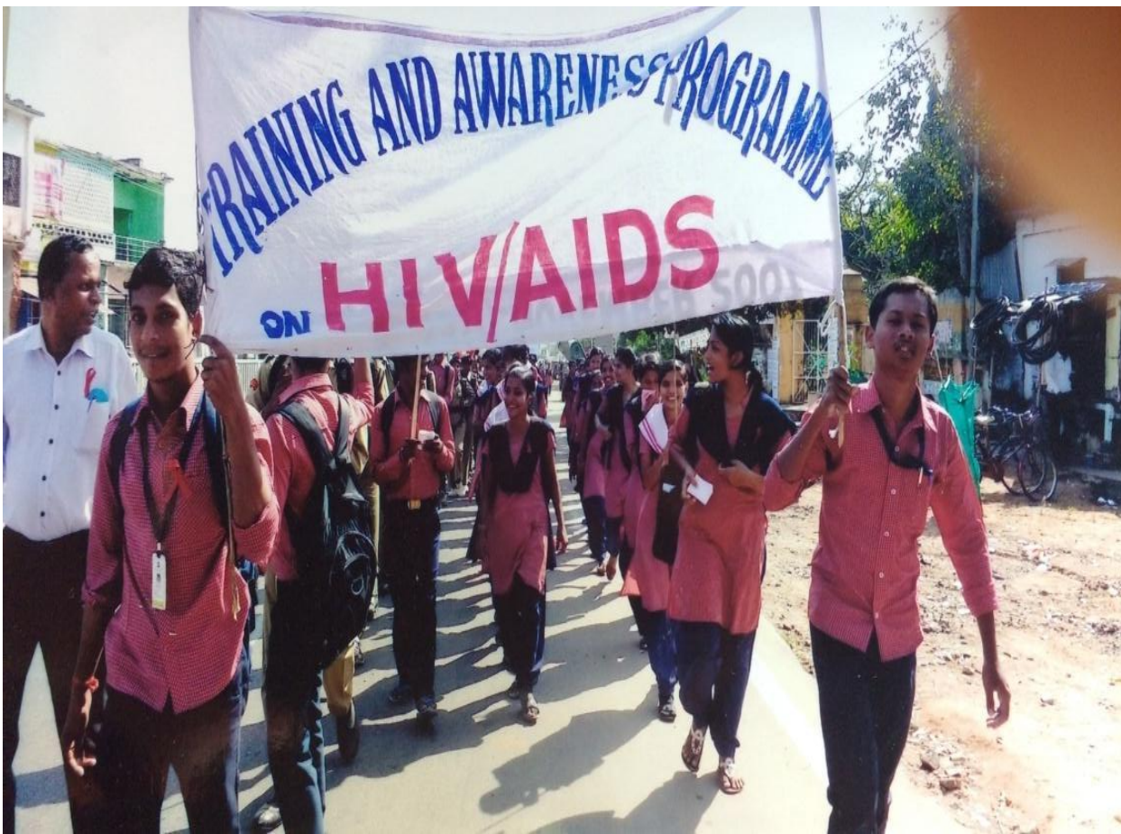
AWARENESS PROGRAMME ON WORLD AIDS DAY, DATED ON – 01.12.2014