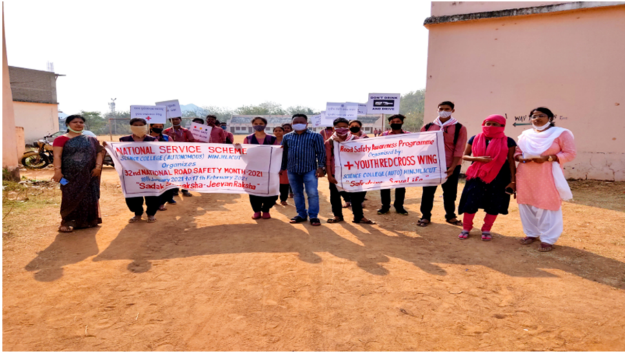
Road Safety Rally held on 17.2.2021 on national High way 57, to aware the Local People about the safety rules