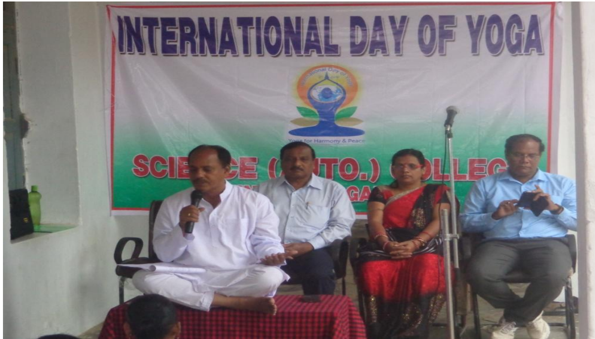
Observation of International Yoga Day DATED ON – 21.06.2015