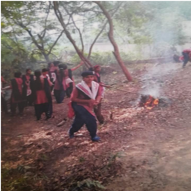
Clean Campus Drive on 7 th Dec. 2018