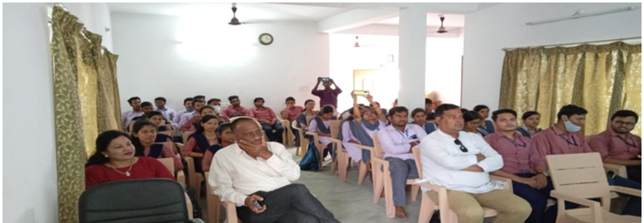
International Women'sday Celebration on March 8 th 2021. A Seminar was held on the topic" Role of Women in Environmental Conservation"