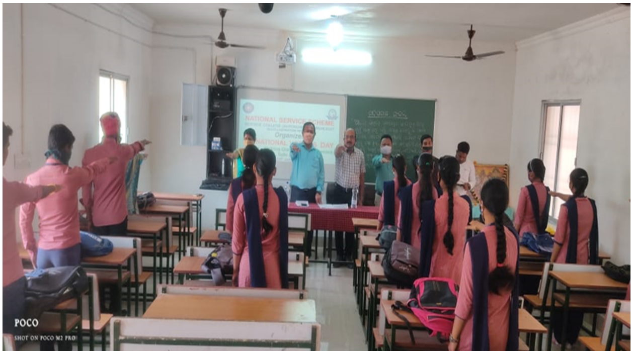
Observation of National Voters Day on 25 th Jan.2021