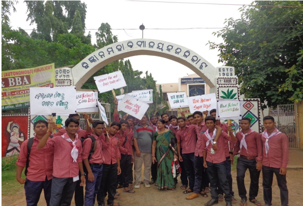
Helmet Awareness Programme On NH-59 on dated- 26.07.2016