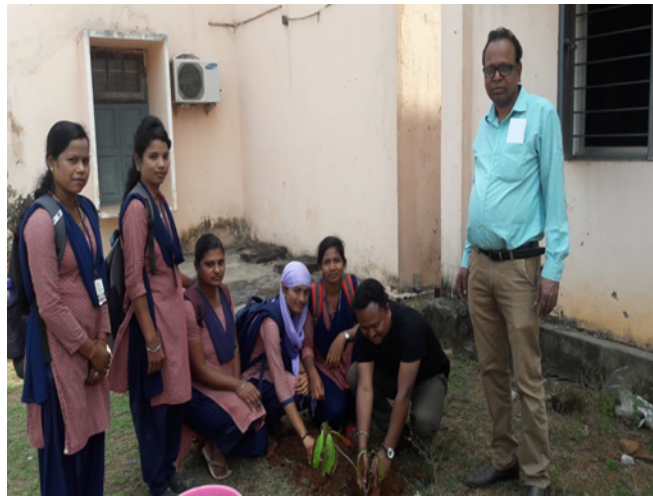
Plantation Program in college Campus on 26 th January 2019.