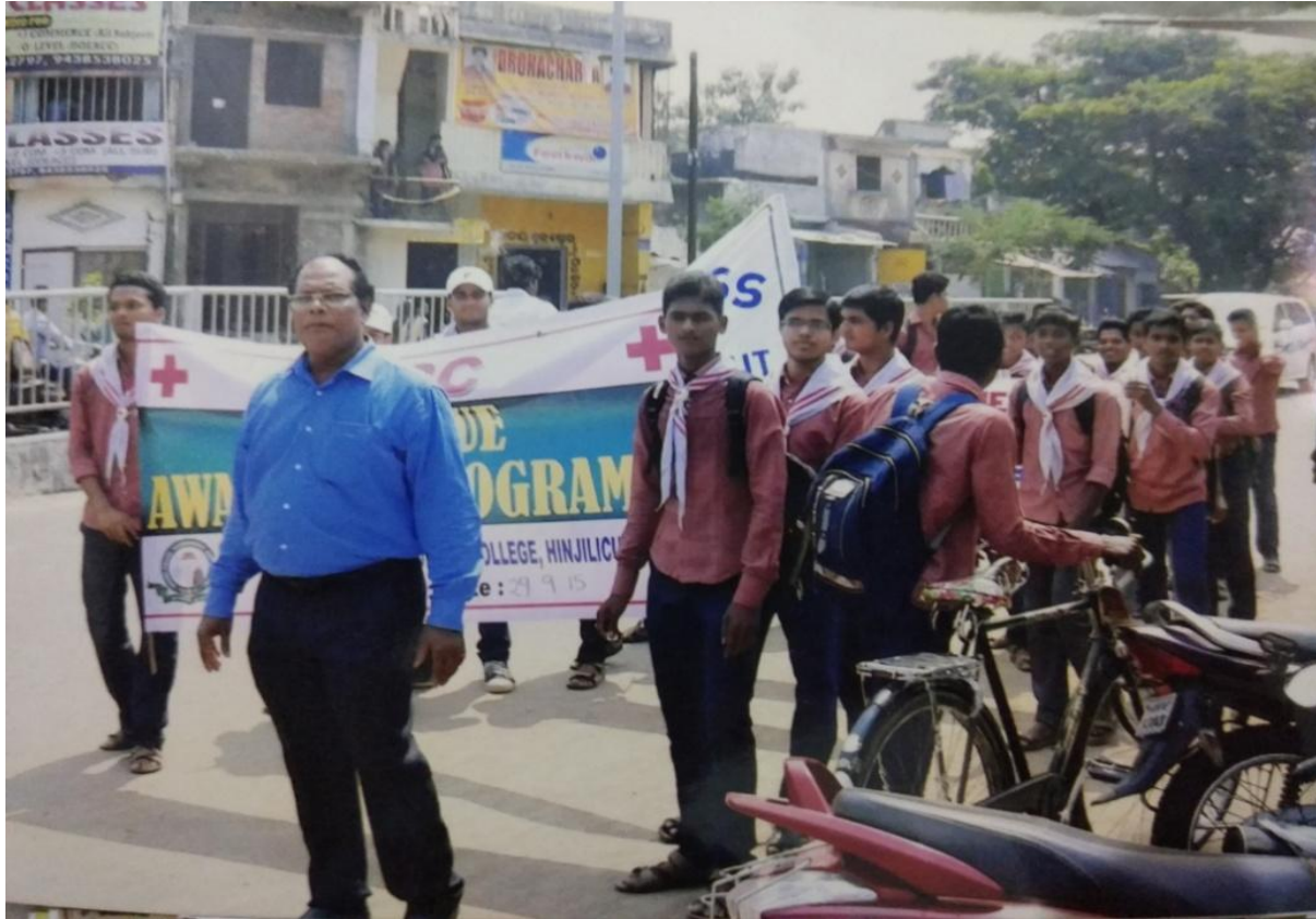
Dengue Awareness Rally Dated on – 28.09.2015