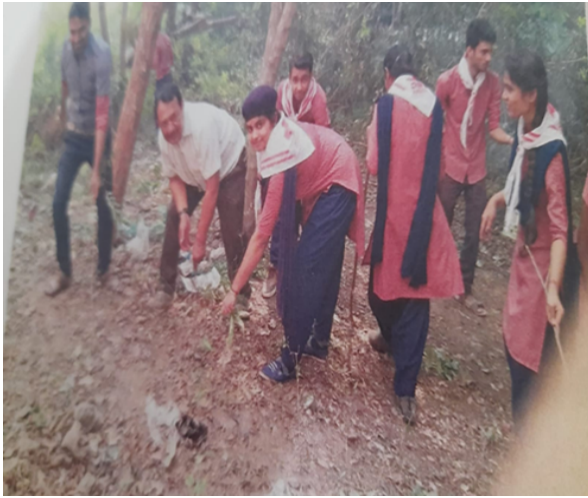
A Campus Cleaning program on 27-6-2018