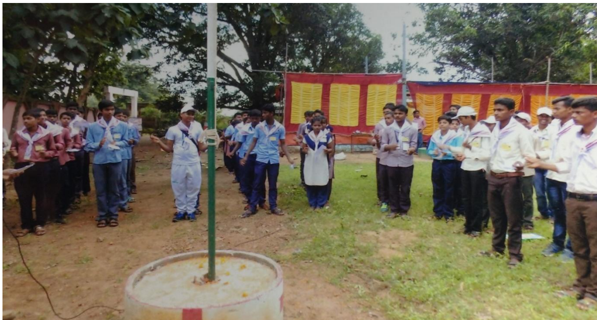
Student volunteers with counselor at Anchalikamahavidyalaya