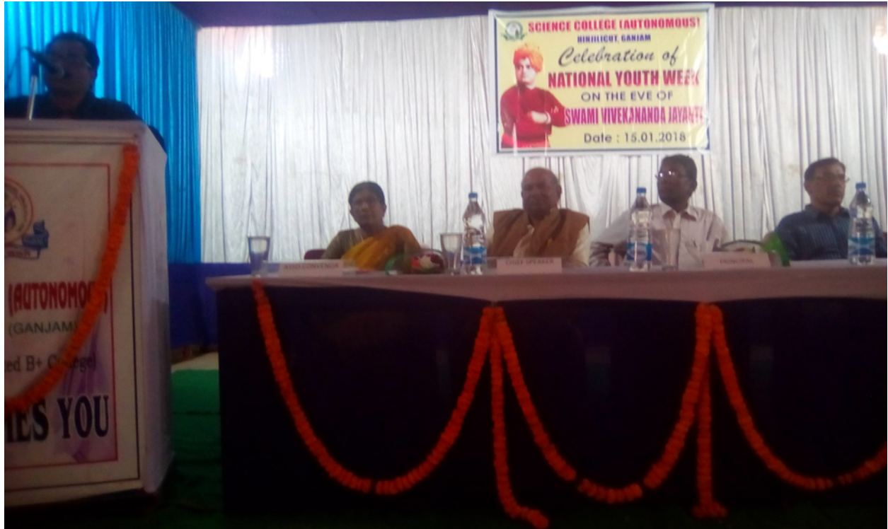
National youth week was organized by YRC on 15-1-2018