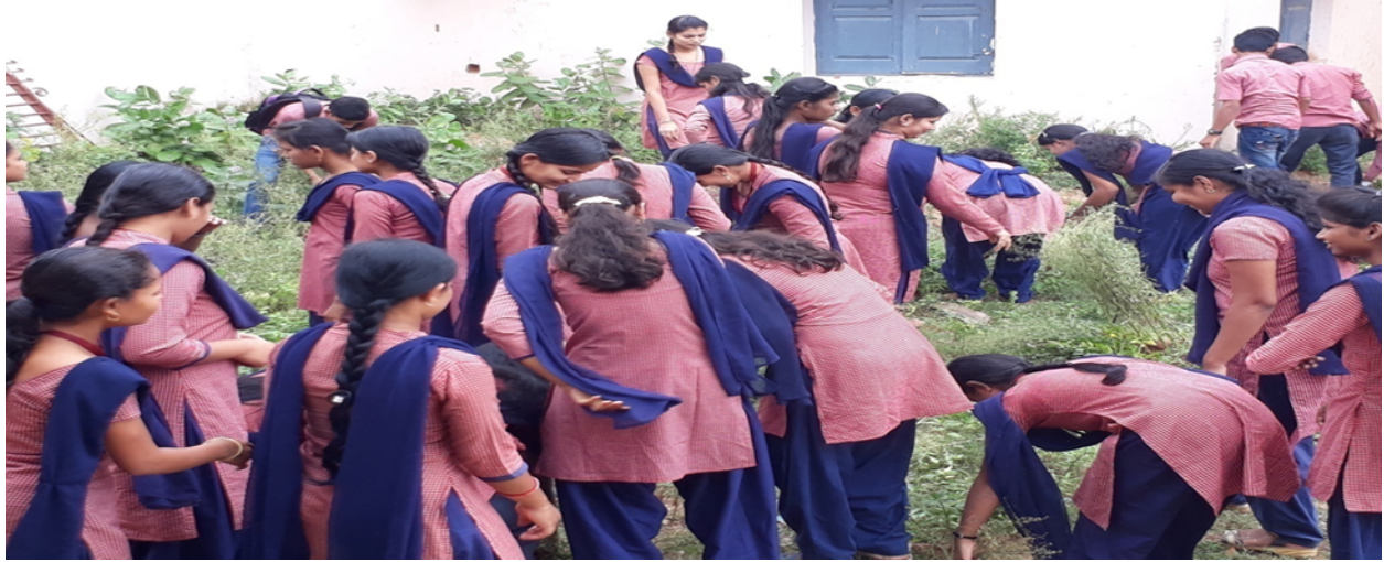
Campus Cleaning program in 26 th Jan 2019