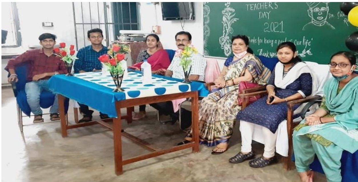
Teacher's Day Celebration- organized by our YRC volunteers and the Students of Botany on 5 th Sept. 2021