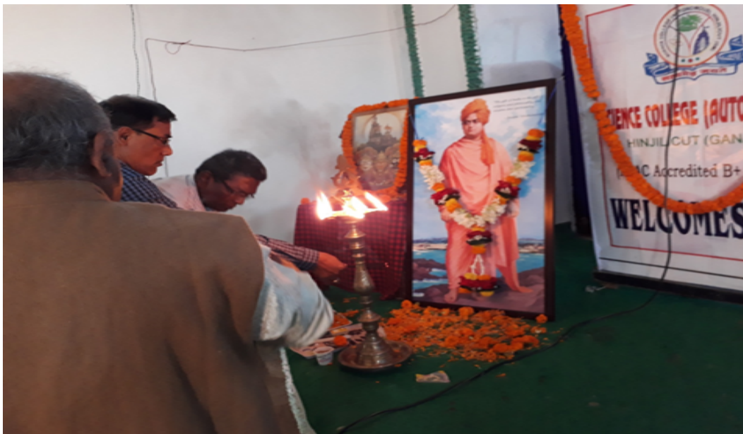
National Youth Day on 12-1 2020