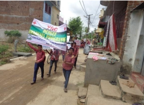
“Dengue Awareness Programme”At village Ankoroda on dated – 27.07.2016