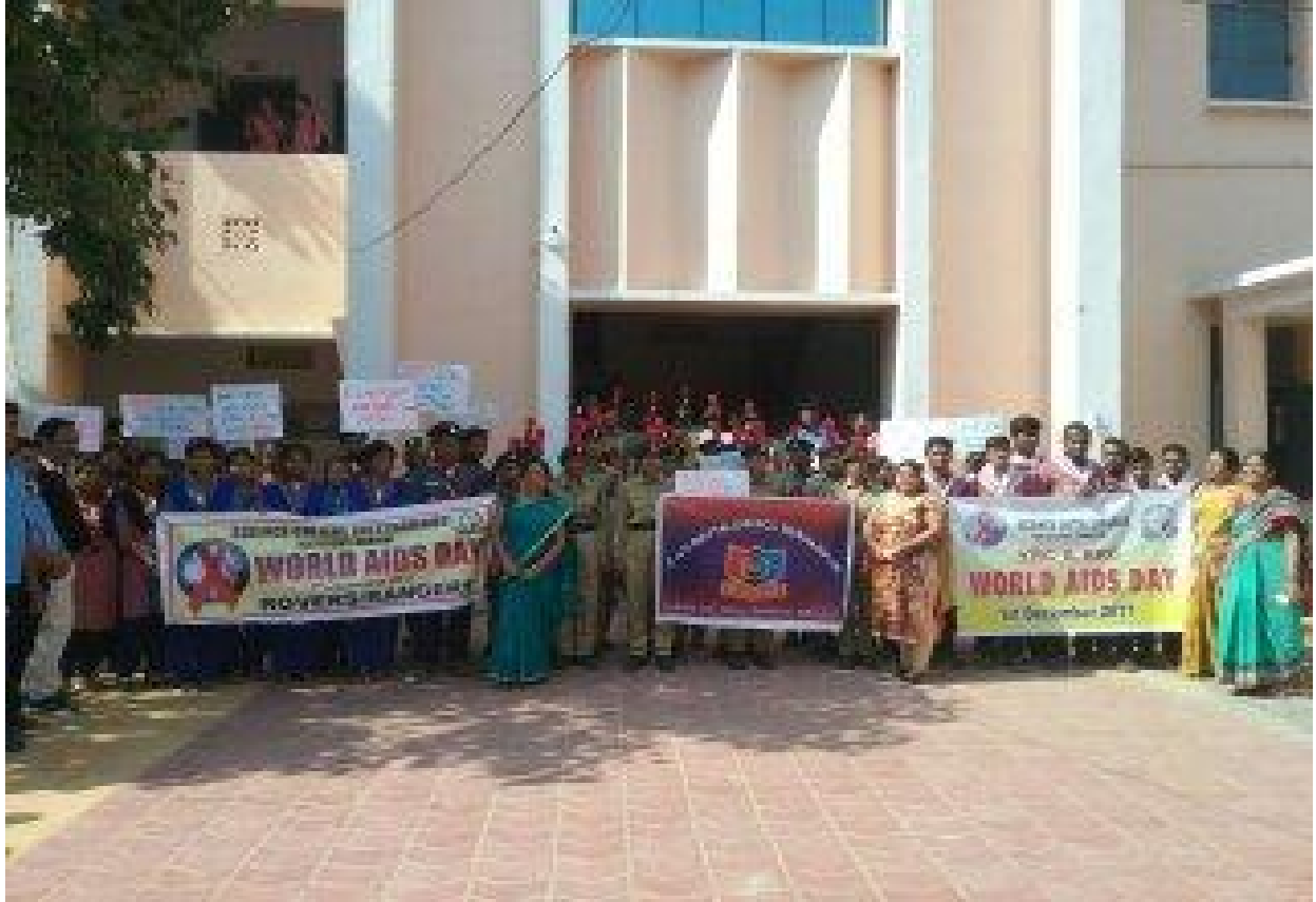
World Aid'sday- an Awareness Program in the local area on 11-12-2017