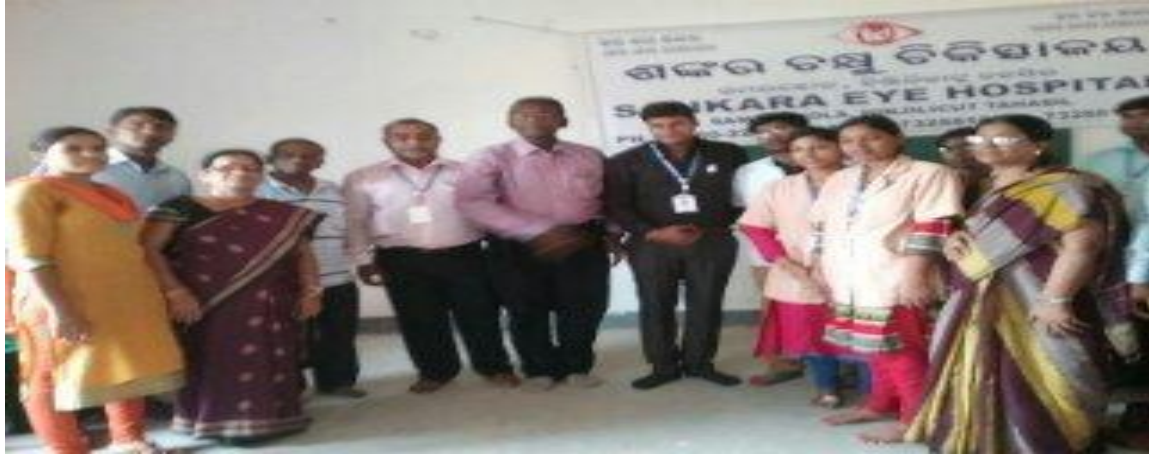
Eye Checkup Camp organized by YRC wing by the Shankar Eye Hospital, Samarjhola, Ganjam- on 11-8-2017.