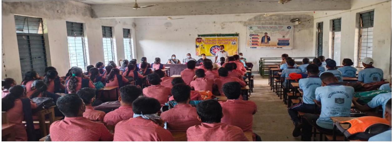
Voter awareness program on 18-11-2021